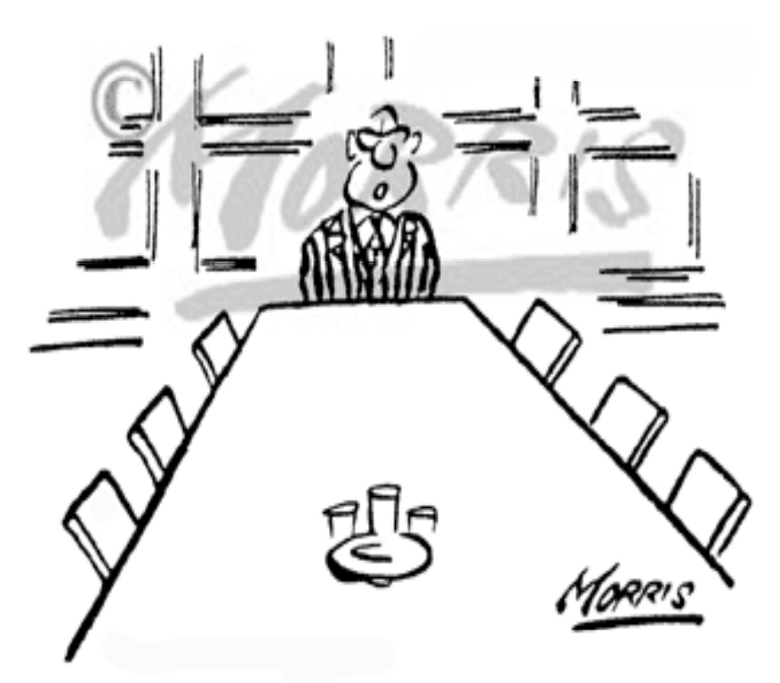
"I've called this meeting to discuss absenteeism."